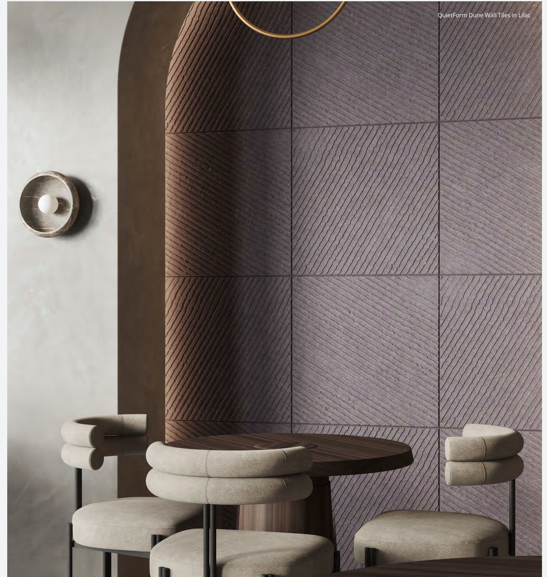
Design one-of-a-kind soundscaping mosaics with Acoufelt acoustic wall tiles + shapes . Combine colors, tones, and patterns in geometric and organic shapes to reflect a client's brand or design concept.