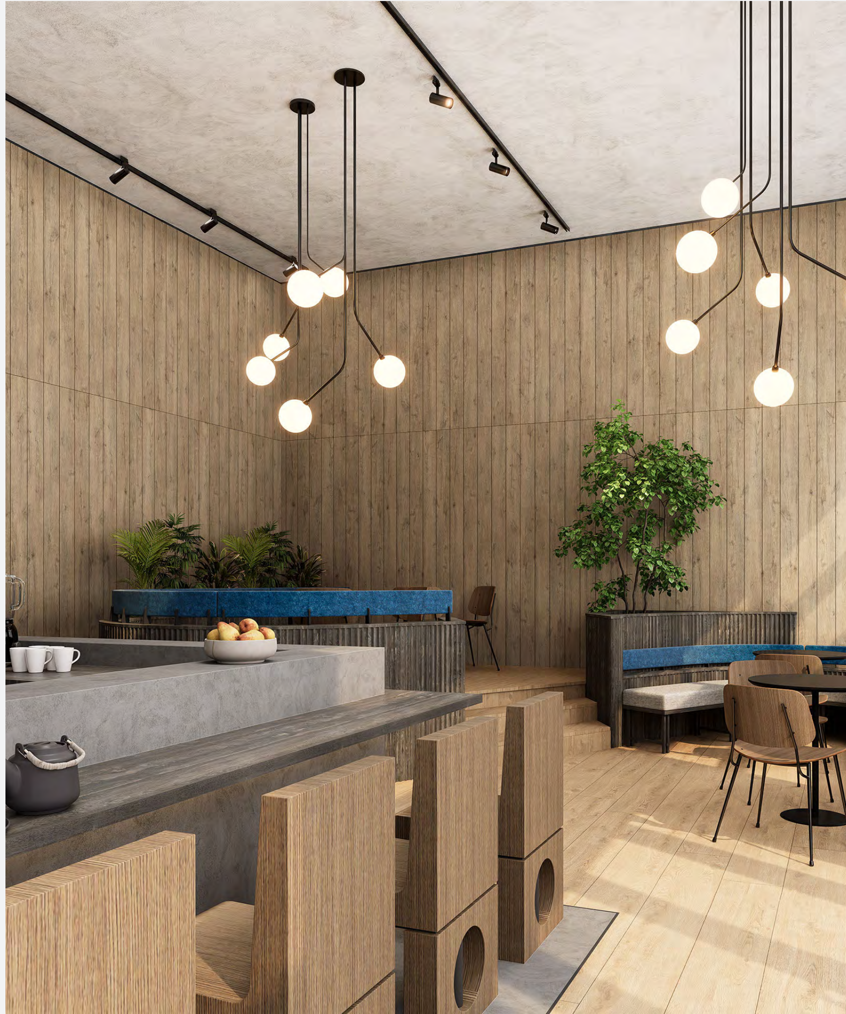
WoodBeQuiet Slats 8-inch Wall Panel in Boardwalk with Deep Brown V-cut