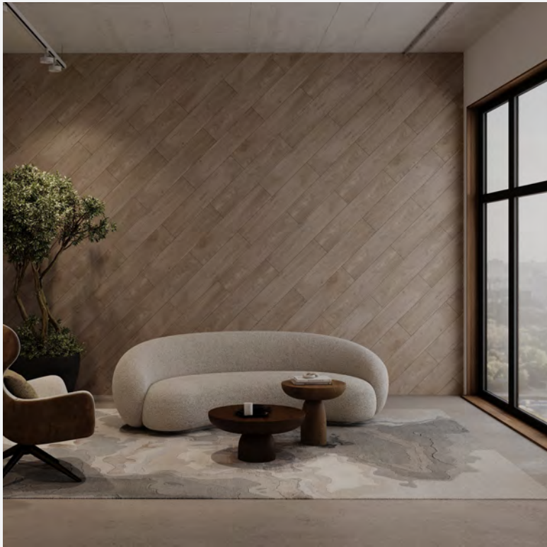
WoodBeQuiet Wall Planks in Weathered Slate

WoodBeQuiet elements instill the beauty and sophistication of wood while supporting healthy soundscapes. Proprietary Acoufelt technology applies high-res woodgrain images to smooth, sound-absorbing felt for no-compromise acoustics. Select from 30 options and combine finishes for a singular look.