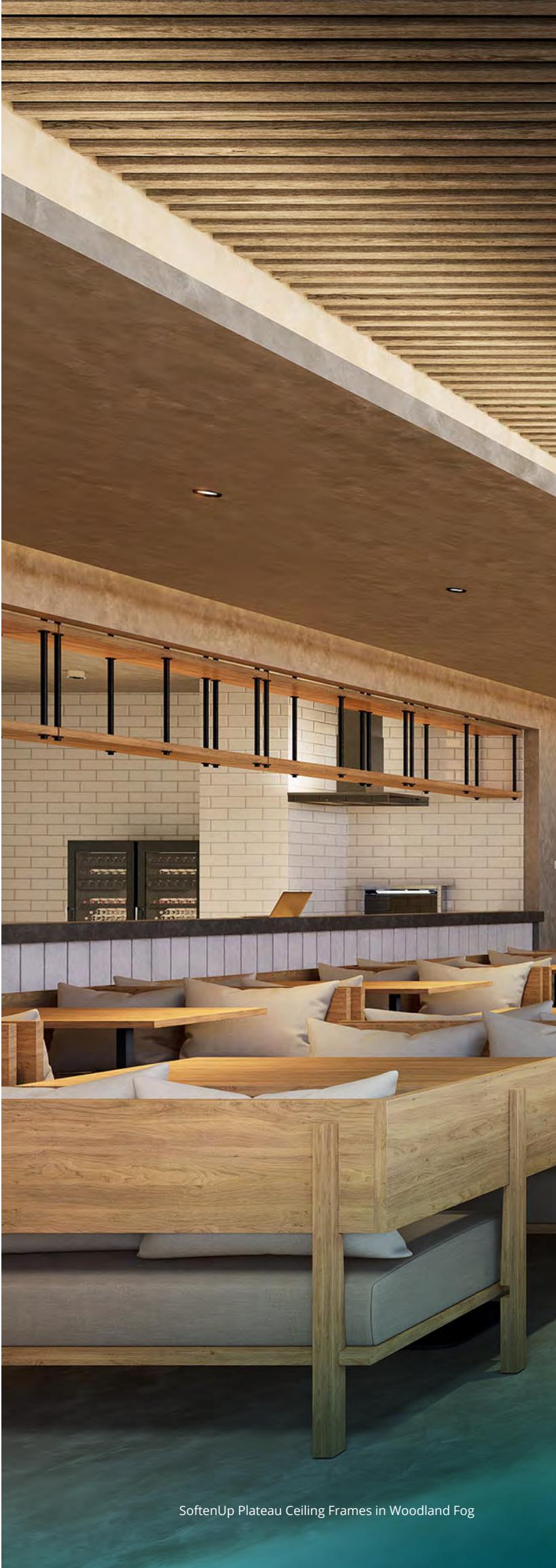
SoftenUp Plateau Ceiling Frames in Woodland Fog