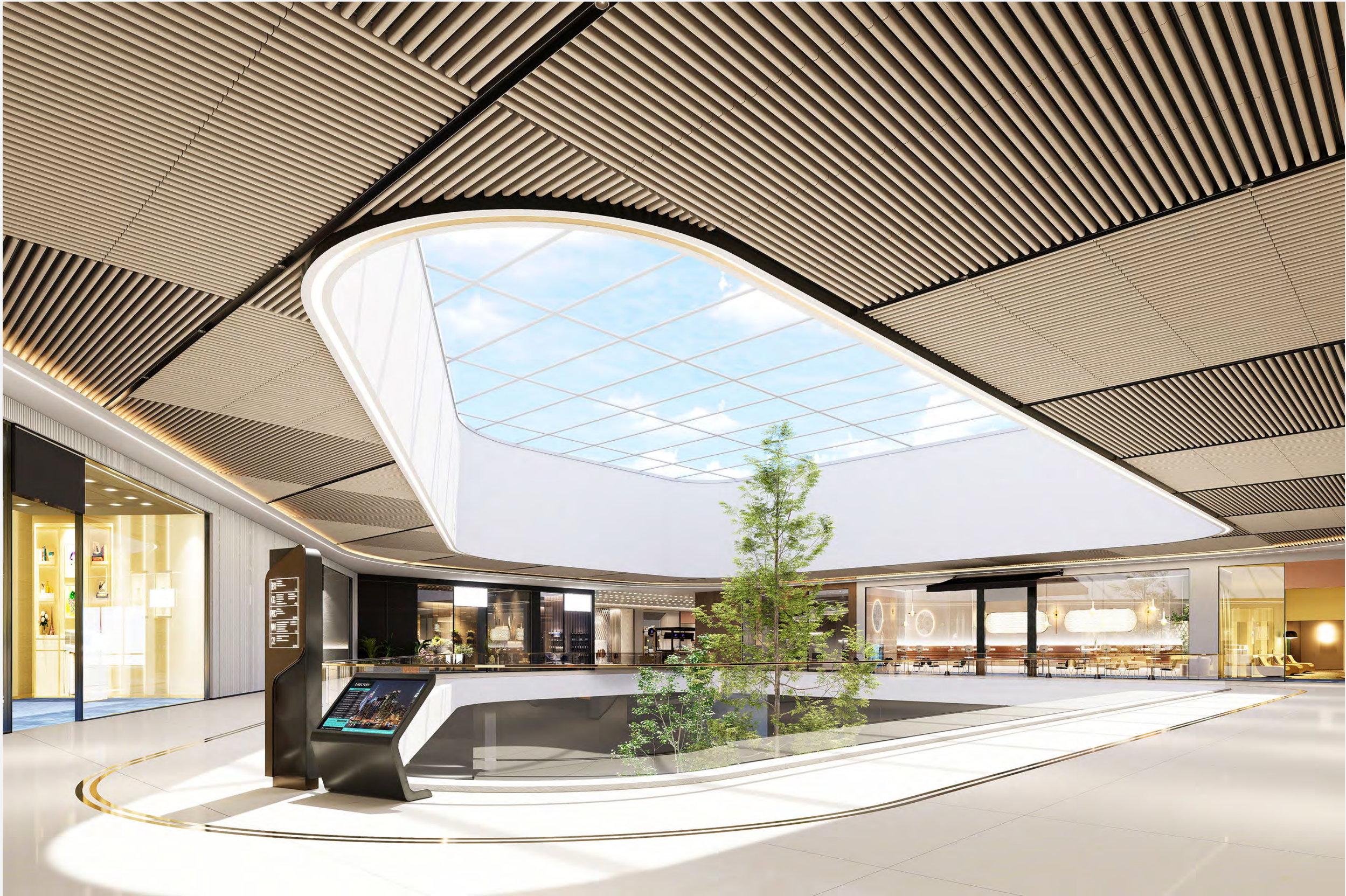
SoftenUp Foothill Ceiling Frames in White Oak

Award-winning SoftenUp™ modular ceiling frames infuse a warm, welcoming atmosphere. Each tile, comprised of linear slats, fits seamlessly in standard 15/16" T-grid drop-ceiling grid systems for effortless installation. Choose the profiles, sizes, and colors that suit your project.