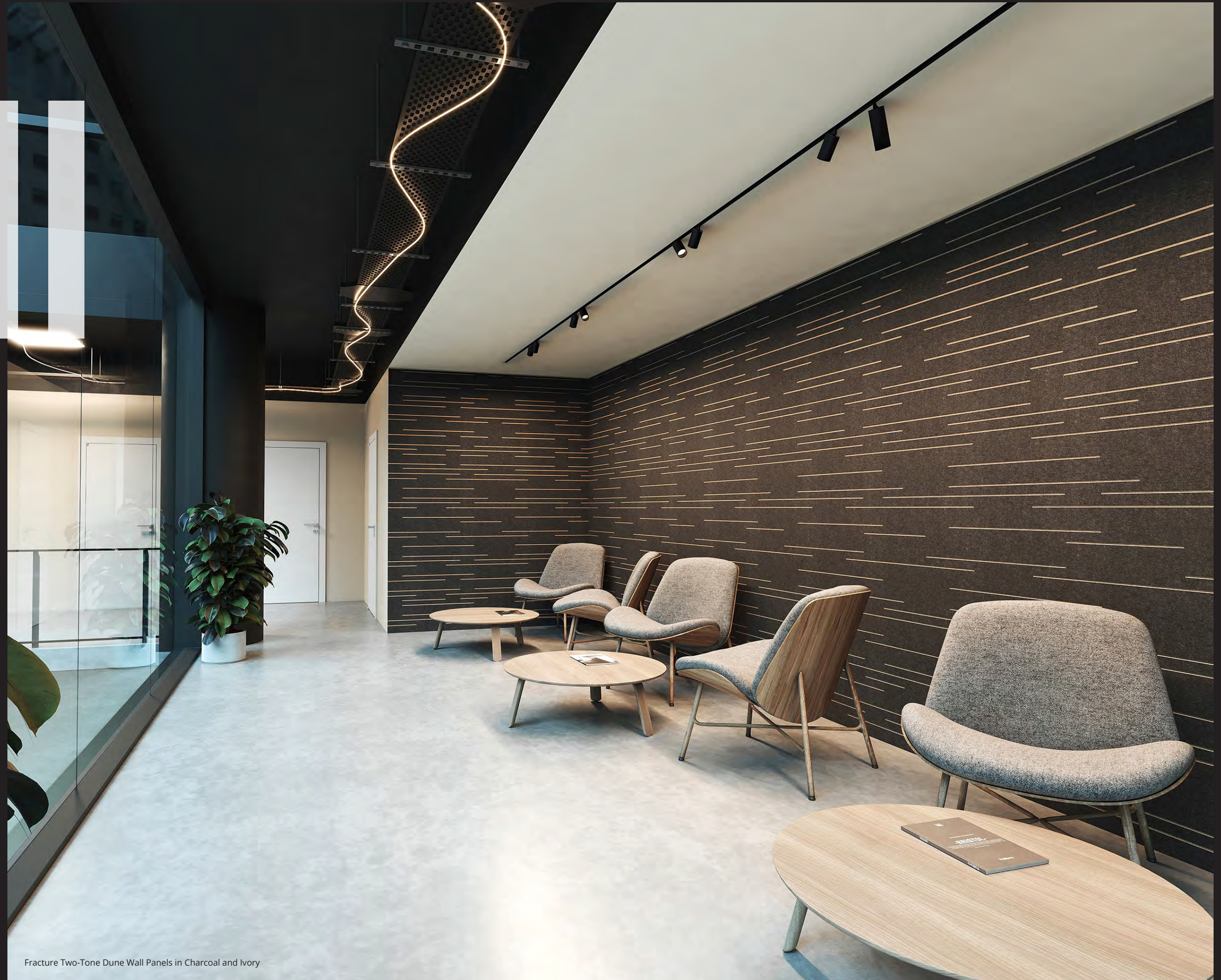
Fracture Two-Tone Dune Wall Panels in Charcoal and Ivory

Acoufelt acoustic panels rely on earth-friendly felt to gather and eliminate unwanted sound. Choose from multiple thicknesses, more than 40 colors, and myriad textures and patterns to sculpt and divide space.