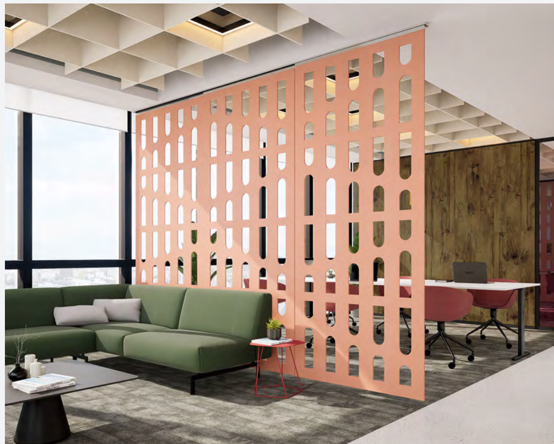
Top: Pixel Triangle in Popcorn and Almond Bottom: Creative Cut Screens Waterfall in Flamingo