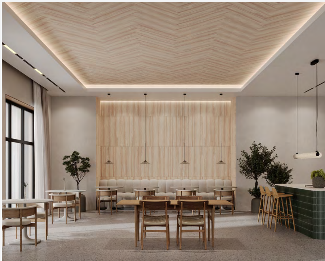
Top: Ripple Ceiling Baffles in Platinum and Slate; Fracture Wavelength Wall Panels in Wasabi Bottom: WoodBeQuiet Wall and Ceiling Planks in Lyed Larch