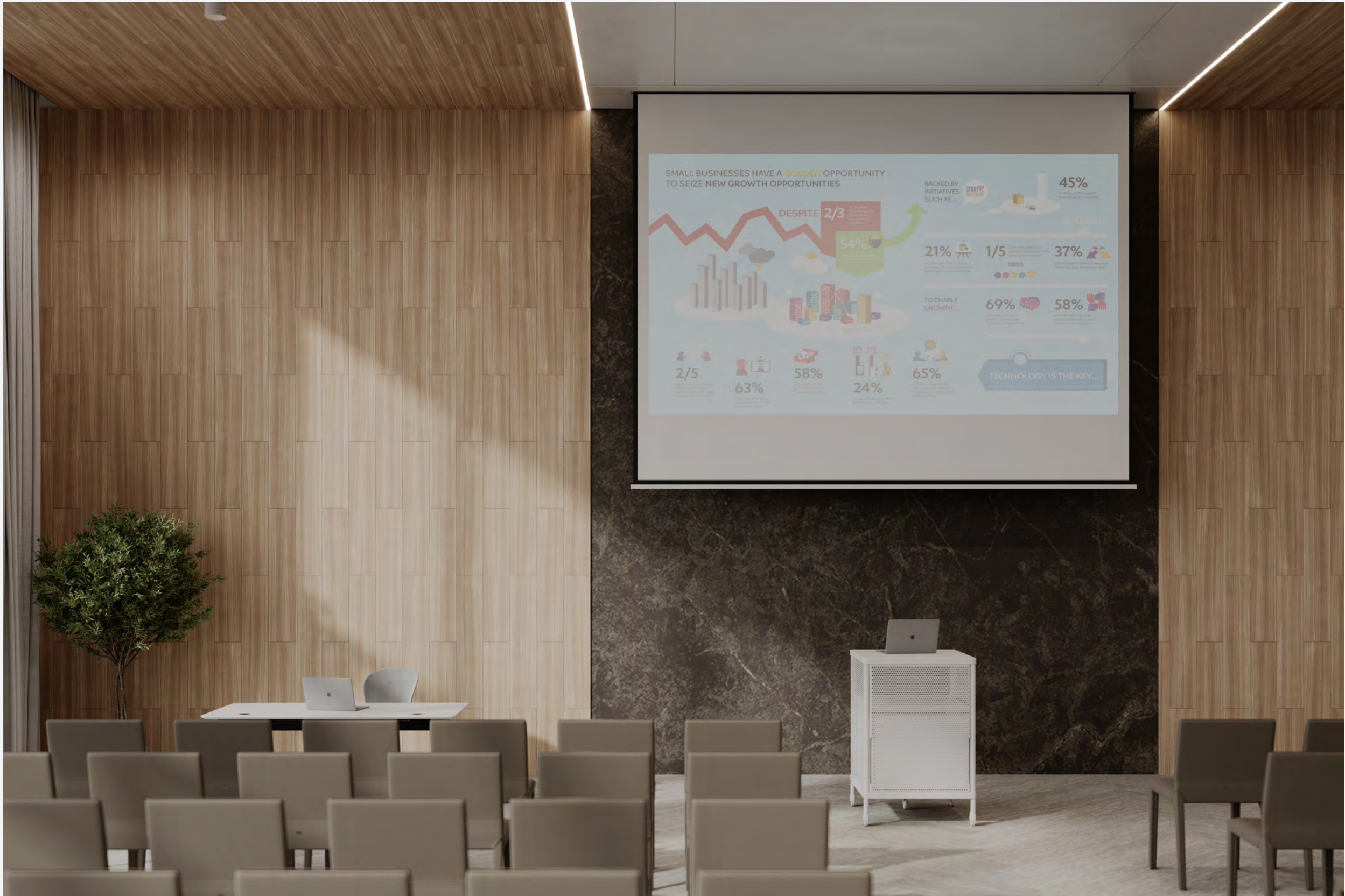
WoodBeQuiet Wall and Ceiling Planks in European Larch

WoodBeQuiet elements instill the beauty and sophistication of wood while supporting healthy soundscapes. Proprietary Acoufelt technology applies high-res woodgrain images to smooth, sound-absorbing felt for no-compromise acoustics. Select from 30 options and combine finishes for a singular look.