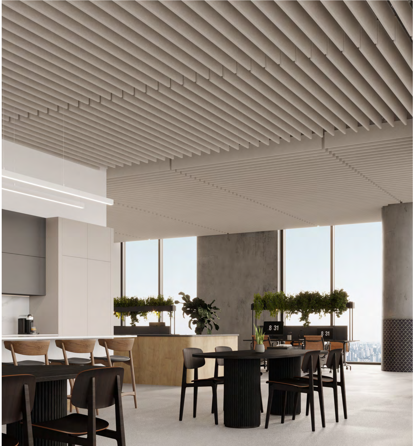
Linear Ceiling Baffles in Almond

Acoustic ceiling baffles provide added surface area to ceiling surfaces to absorb and soften sound in naturally noisy or intentionally quiet areas. Easy to specify and install, ceiling baffles are a visually attractive, highly effective first step in any soundscaping strategy.